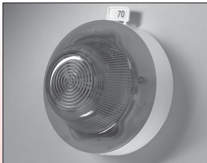
Part no 55000-877

See also the note on BS 5839 : 1 : 2002 overleaf.